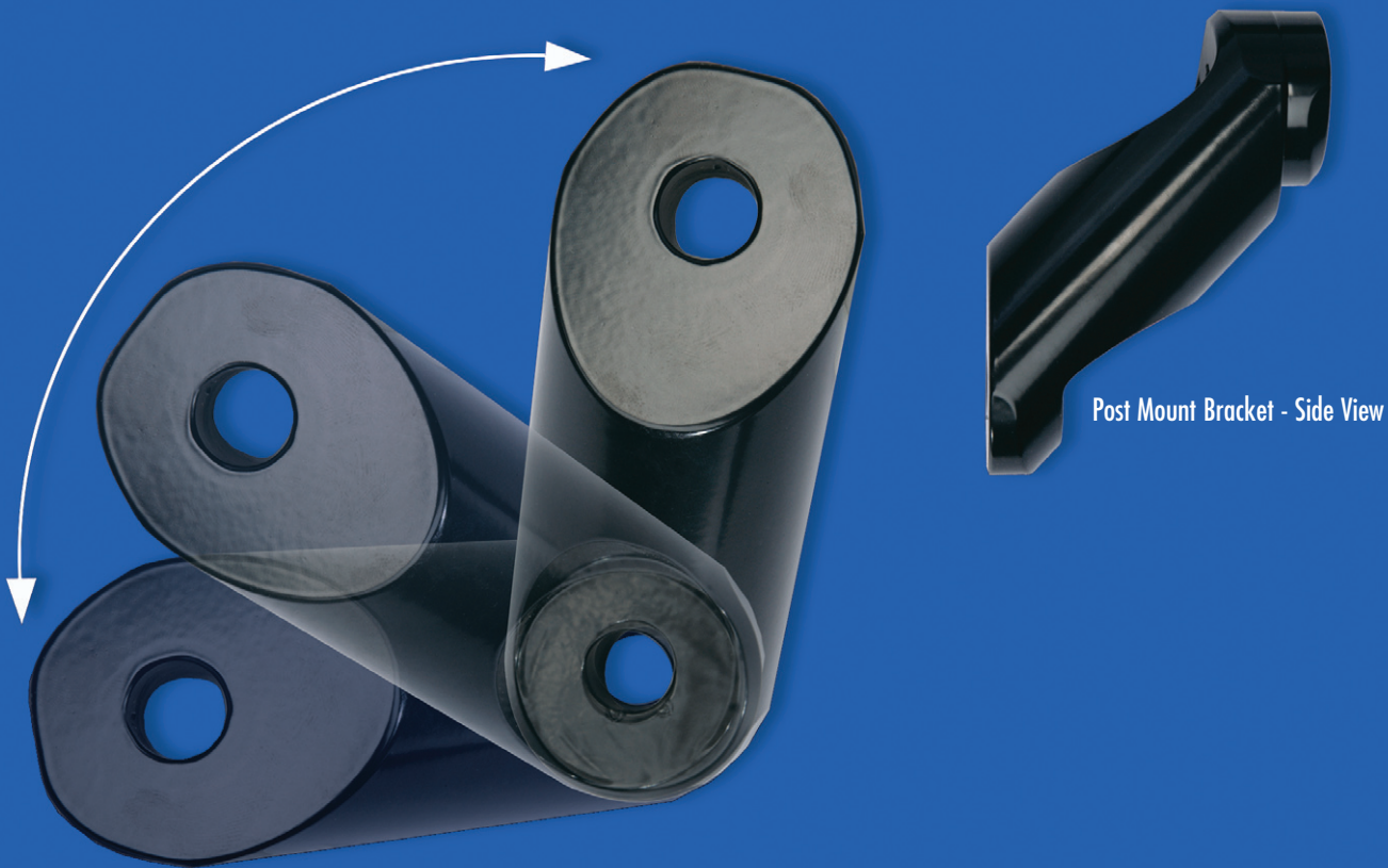
Post Mount Bracket - Side View