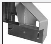
Inside view of the foot. Please note the design to achieve the strength needed

Foot assembly with the cut outs for the U-bolts to mount through and also, the pre-drilled mounting holes for side mounting. Your choice!