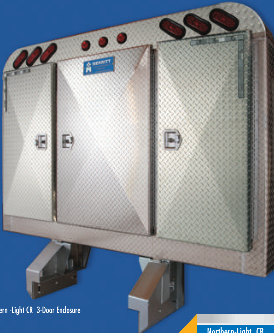
Northern -Light CR 3-Door Enclosure