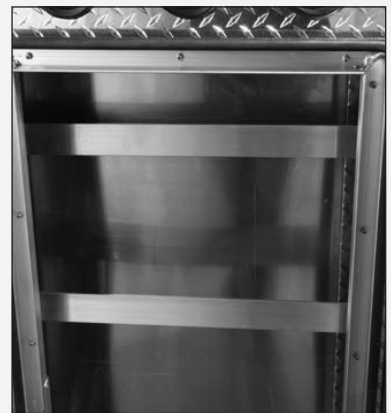
Chain hangers in each side compartment