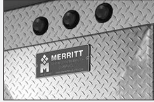
Three LED Marker lights centered