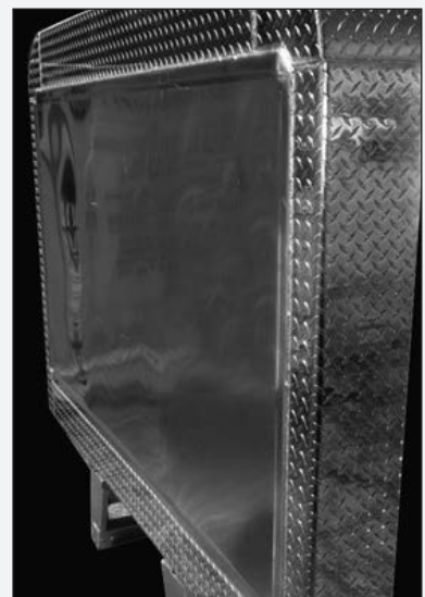
No rear Beams. You can get the unit closer to the cab than a normal CR.