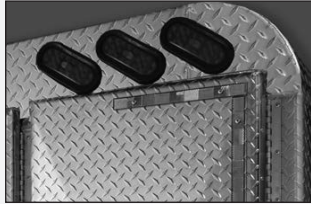
Three LED stop/turn lights in each corner.

3240 Northern-Light Clamp Kit (14" U-bolts) 31