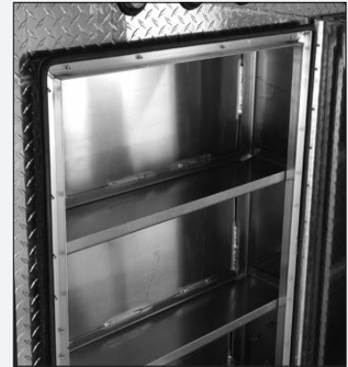
Center compartment with 2 shelves