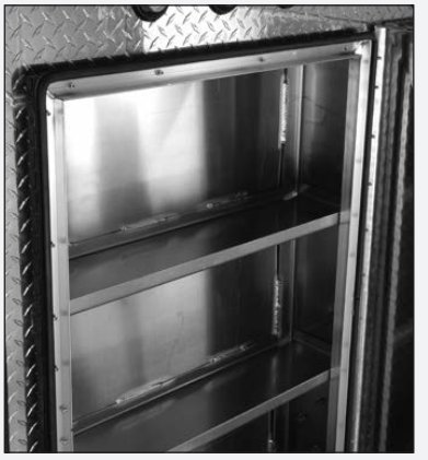
Center compartment with 2 shelves