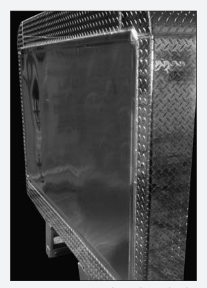
No rear Beams. You can get the unit closer to the cab than a normal CR.