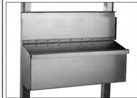
3512 Fitting Box