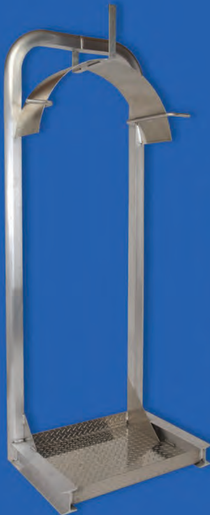
3513 Hose Rack (Pictured w/optional 3511 Base Tray)