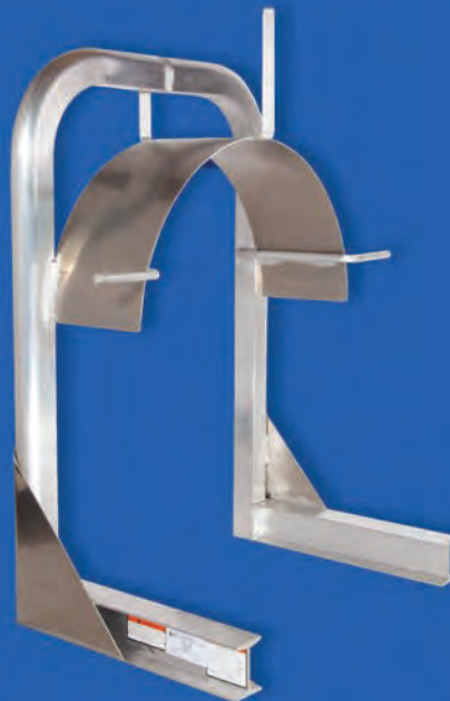
3683 Short Hose Rack