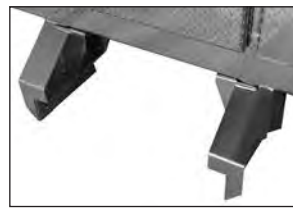
The foot is made of steel and is Zinc plated for anti-rust and a finished look.