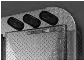
Three LED stop/turn lights in each corner.