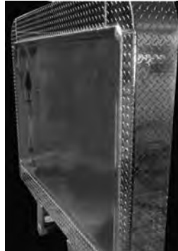
No rear Beams. You can get the unit closer to the cab than a normal CR.

Must be side mounted (drilled) or mounted with the 3240 kit.