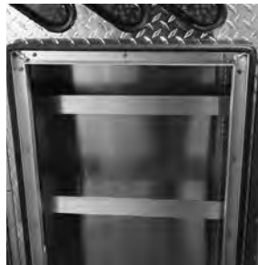
Chain hangers in each side compartment