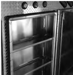
Center compartment with 2 shelves.