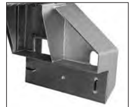
Inside view of the foot. Please note the design to achieve the strength needed.