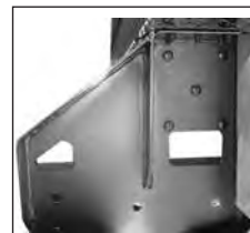
Foot assembly with the cut outs for the U-bolts to mount through and also, the pre-drilled mounting holes for side mounting. Your choice!