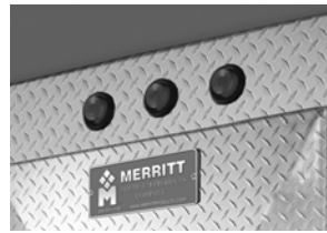
Three LED marker lights centered.